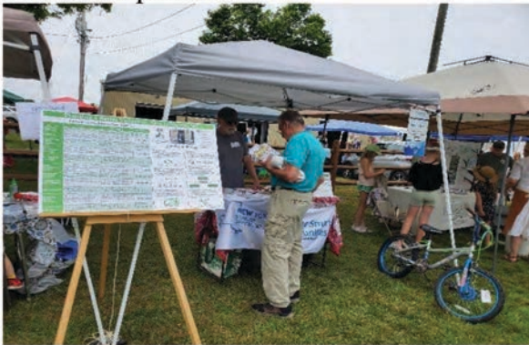
The CSC booth at Climate Carnival

And other CSC projects are proliferating. Several of the ongoing ones were featured at the recent Columbia County Climate Carnival: the Repair Café, the Free Store, Heat Pump campaign, and Bike Repair and Distribution. Some photos: